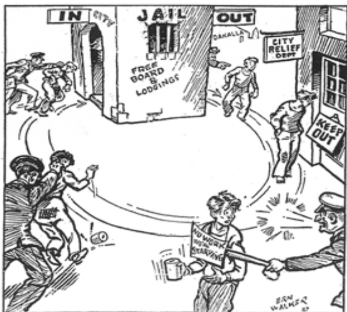
The Federationist, Vancouver 23, June 1938